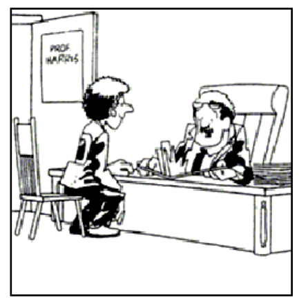
Always Meet With Your Advisor!

HY 465/565 – Islamic Civilization: The Crusades from the Other Side (Williams)