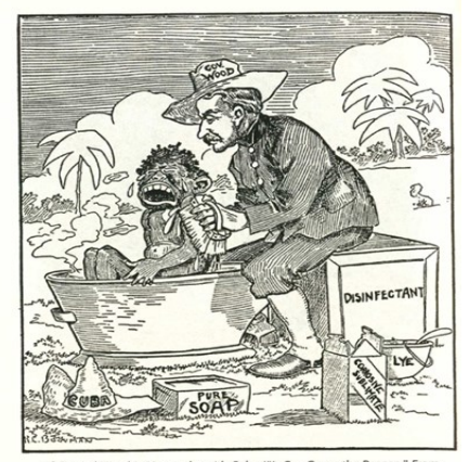
"If General Wood Is Unpopular with Cuba, We Can Guess the Reason." From Minneapolis Tribune (1901), reprinted in Literary Digest 22 (March 30, 1901).

the island, and left only when the new Cuban government acquiesced to mediated sovereignty. The U.S. justified these actions by spinning two myths: first, that the U.S. government intervened militarily only for humanitarian reasons, making it a benevolent world power, and, second, that the Cubans were unruly savages, which left them unfit for modern democratic governance.