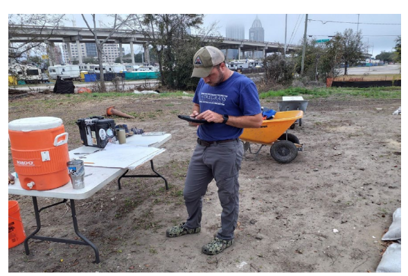
Emlid RTK system and tablets in operation in the field